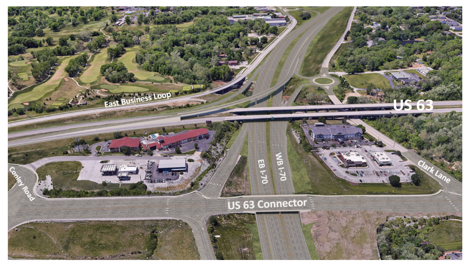
Additional renderings and final plans will be available at the public meetings to be held in Spring 2024 in central Missouri. Meeting dates will be announced soon.